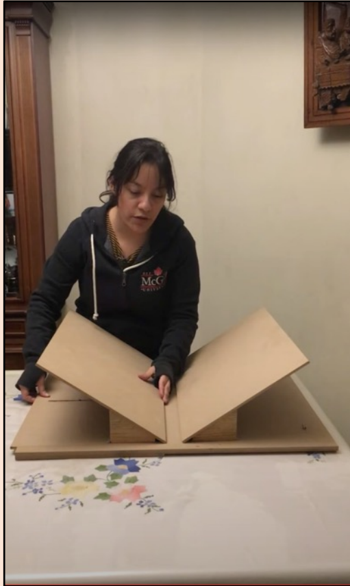
Upside v-shaped configuration https://www.youtube.com/watch?v=VDkJQSMjB0s