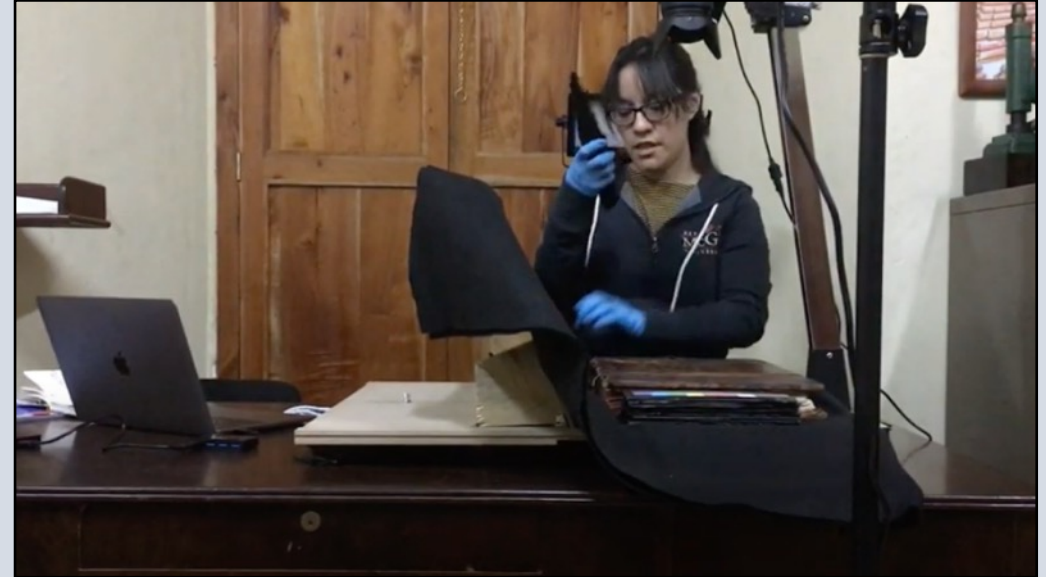
Reaching the other end of the book

https://www.youtube.com/watch?v=4KFCOM8Vndo