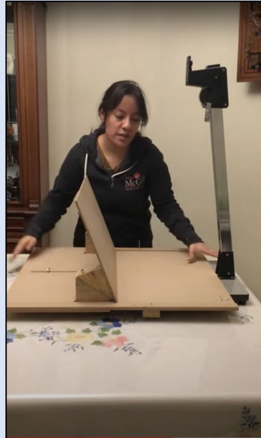
Open-at-one-side configuration https://www.youtube.com/watch?v=ULAE4sE2Wqg